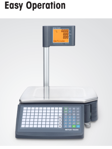
Outstanding readability, Customized keyboard, logical menu structure and high performance printer make operating easier.

Powerful application and solid hardware interface help retailers to professionally manage their business. Open label design and seamless application interaction sets bCom S apart from others.